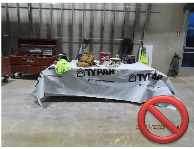
(Also, do not store anything on top of the stored material)

When the wrong material is used, organic growth could occur and damage the material that we are trying to protect. The higher perm rating the more "breathable" the covering.